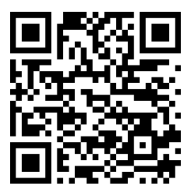
Scan to see digital map of all schools across the U.S.

In February 2025, NABS released its latest research identifying 526 Indian boarding schools in the United States. This three-year project resulted in the largest known list of U.S. Indian boarding schools ever compiled to date. Scan to learn more.